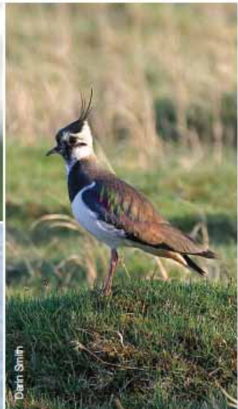
Clockwise devil's-bit scabious, lapwing, redshank